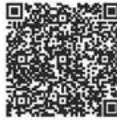
Scan for H-Fit.com

Always talk to your health care provider before starting any new exercise routine.